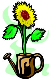
Containers must have good drainage.

It must have drainage holes: Any container will work as long as it has good drainage. Plant roots need oxygen if they are in a closed container the roots can't breathe. Stones in the bottom are not an option, eventually the water can build up and it will start rotting the root system of the plants. Consider the size of the plants or plant you want to grow. There must be enough room in the container for the plants roots to grow or the plants growth could be stunted. Clay pots will dry out faster than plastic pots. The clay adsorbs the extra moisture. Why not use some recycled