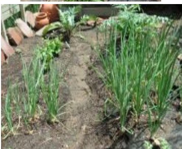
without WeedGuard with

Preparing your soil is the first step in healthy vegetables. Work in 3-4 inches of organic matter. When I plant my veggies, I also dig the whole deep and mix in worm castings and an organic vegetable fertilizer. When I plant my broccoli, tomatoes, peppers and brussel sprouts plants, I cut a piece of a paper towel roll or use a small piece of a paper bag to wrap around the stem of the veggie to protect it from a nasty cut worm. They come out at night and cut your veggies right off at the soil level then just leave it laying there for you to find the next day. They want bunnies to take the blame. Bury half of the