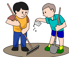
Offer kid-sized tools