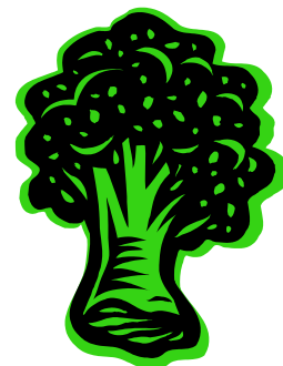
Planting edible trees can be fun. Broccoli is easy too!

Nasturtiums —These are fun edible flowers, taste like radishes. They can be planted in poor soils and tolerate dry conditions.