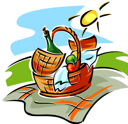
Be safe this 4th of July with these food tips

water and freeze ahead of time. With the baggies or sealed plastic jugs, the melted ice can be used for cold drinking water.