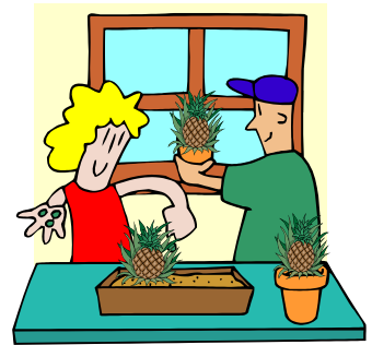
You can grow your own plant!

7) Don't forget to have someone cut up the rest of the pineapple to eat. Yum!