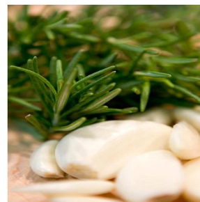
Let's stay healthy this winter with Garlic and Rosemary

bathwater will make even the worst cold seem like it's gone forever, never to return. I will include a bit of history on these herbs as well. Both have been used for centuries all over the world.