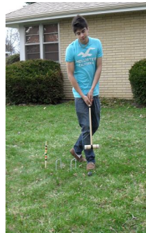
Have a safer lawn for playing Croquet

The question is, "Can we have a beautiful healthy lawn without the use of synthetic chemicals?" The answer, "Yes we can"! Whether it's a new lawn or an existing one we can rid our lawns of weeds, diseases and pests with environmentally safe practices and products. We already know natural and organic products are safer for us, pets and the environment. I'm not going to say organic lawn care is an easier way to go, at least not right away. When first switching to organic from chemical, you may need a bit of patience. It is you