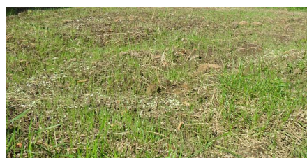
With Happy Frog Soil Condi-